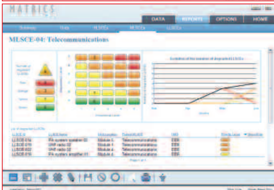
(Top) Screen shot showing list of degraded components